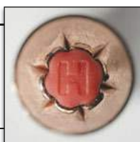
Critical DUTY® ammo features an “H” on the tip.

Critical DUTY® ammo is packaged in 50-count boxes for Law Enforcement.