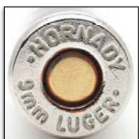
Critical DUTY® ammo features waterproof sealant around the primer.