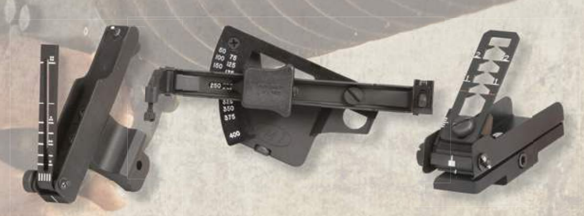
L2B/L2X MOUNTED LEAF SIGHT - LMP391A

Our launcher systems wouldn't be complete without sights, and we offer several different models to suit the operator's needs. We designed the LMP391A, our newest leaf sight, for the New Zealand Defence Force. It attaches directly to our rail mounted launchers.