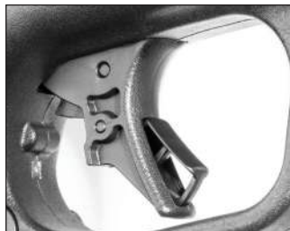
M2.0 Flat Face Trigger