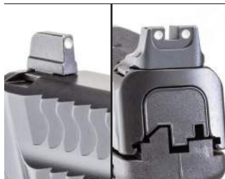
Tall, White Dot Sights

Armornite® finish is a hardened nitride finish that provides enhanced corrosion resistance, greatly improved wear resistance, decreased surface roughness, reduced light reflection and increased surface lubricity. Armornite is used on many S&W® and M&P® products imparting a high level of protection internally and externally where applied.