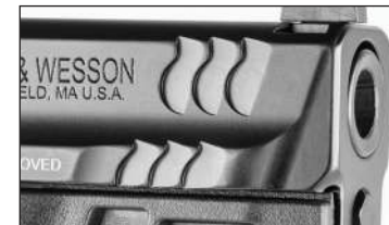
Front Cocking Serrations