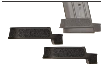
Includes Two Magazine Sleeves for Use with a 17-Round Full Size Magazine