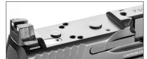
Optics Ready Slide Slide Cut for Mounting Optics Accepts Crimson Trace®, Trijicon®, Leupold® Delta Point Pro, J-Point, Docter, C-MORE, Insight® and Nikon