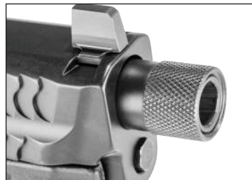
Threaded Barrel .500 x 28 UNEF-2A RH