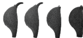
Total of Four Interchangeable Palmwell Grip Inserts