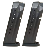
Two - 17-Round 9mm Magazines Included SKU: 194400000 UPC Code: 022188127942