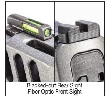
Blacked-out Rear Sight Fiber Optic Front Sight