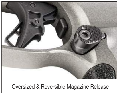
Oversized & Reversible Magazine Release