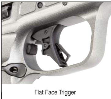
Flat Face Trigger