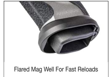
Flared Mag Well For Fast Reloads