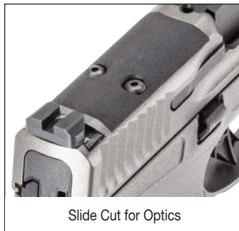
Slide Cut for Optics