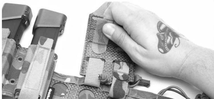
2. FIRMLY GRAB THE PULL TAB AND WEAVE IT THROUGH THE FIRST SLOT OF THE POUCH