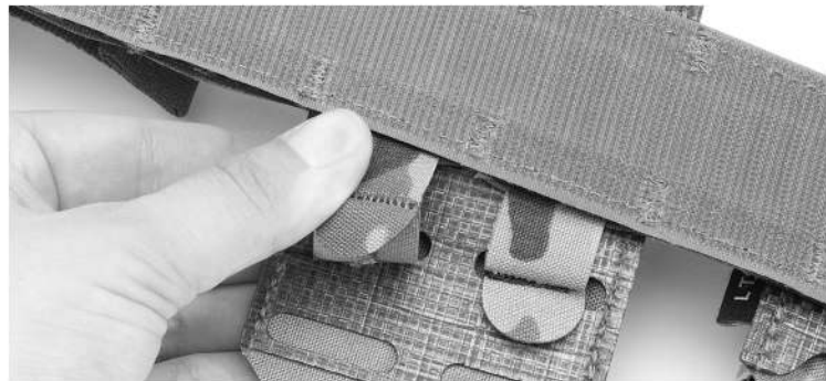
4. COMPLETE BY PUSHING THE PULL TAB INTO THE SECOND SLOT OF THE POUCH.