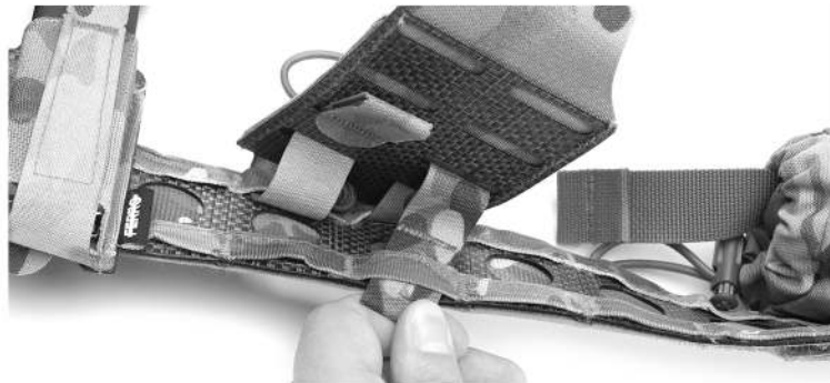
3. WEAVE THE PULL TAB THROUGH THE NEXT ROW OF MOLLE WEBBING