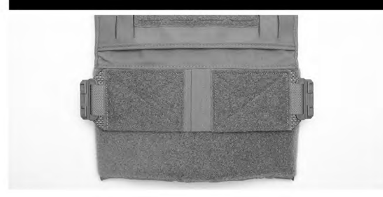
5. FASTEN THE PLATE POCKET SIDE OF THE KIT ON THE PREFERRED LOCATION ON THE FRONT PLATE POCKET OF THE PLATE CARRIER. ALIGNING WITH THE SIDES OF YOUR FRONT FLAP IS OPTIMAL.