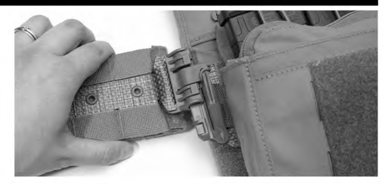
6. ATTACH CUMMERBUND IN EITHER DIRECTION BY SLIDING THE FEMALE SPLIT BAR INTO THE MALE SPLIT BAR UNTIL AN AUDIBLE CLICK IS HEARD.