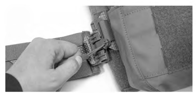
7. DETACH CUMMERBUND IN EITHER DIRECTION BY ENGAGING LIFT GATE AND SLIDING FEMALE SPLIT BAR AWAY FROM MALE SPLIT BAR.