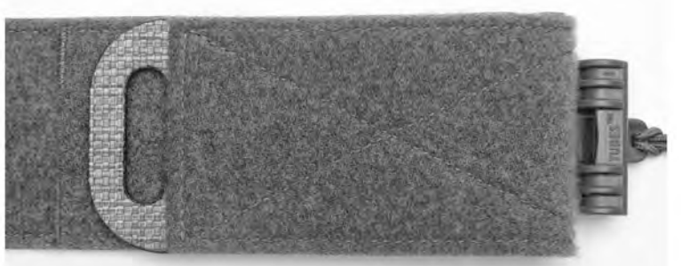
4. FOLD THE FRONT VELCRO® SECTION OF THE 3AC CUMMERBUND INWARDS AND SECURELY FASTEN THE HOOK VELCRO® TO THE LOOP VELCRO® INSIDE THE CUMMERBUND.