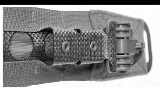
2. START THE TUCKING PROCESS OF ALL 4 TABS INTO THE FRONT MOST MOLLE WEBBING COLUMNS OF THE 3AC CUMMERBUND. YOU CAN FOLD THE CUMMERBUND TO AID IN THIS PROCEDURE.