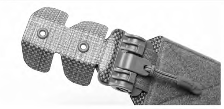
1. TO AID IN THE INSTALL, GENTLY FOLD DOWN THE TABS OF THE FEMALE/CUMMERBUND SIDE OF THE KIT LIKE SHOWN IN THE PHOTO ABOVE.