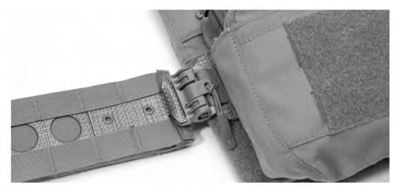
8. REPEAT FOR THE OPPOSITE SIDE AND INSTALL YOUR FRONT FLAP. YOU CAN NOW ENJOY EASY DON/DOFFING OF YOUR PLATE CARRIER WITH THE 3AC CUMMERBUND.