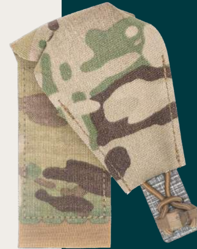
Retention Flap and Silent Tuck Tab