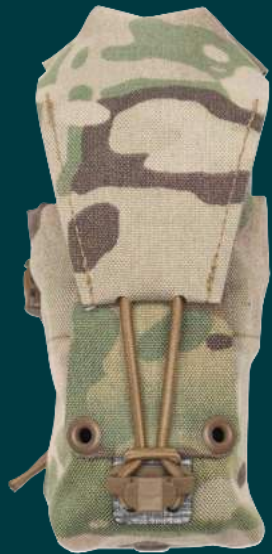
Banger Pocket (Front)