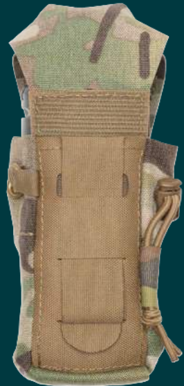
Banger Pocket (Back)