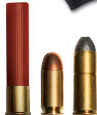
.410 2-1/2" Shotshell