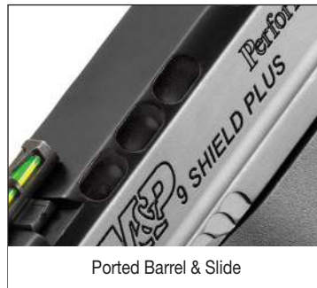
Ported Barrel & Slide