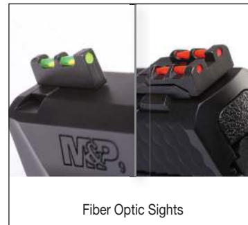
Fiber Optic Sights