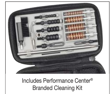
Includes Performance Center® Branded Cleaning Kit