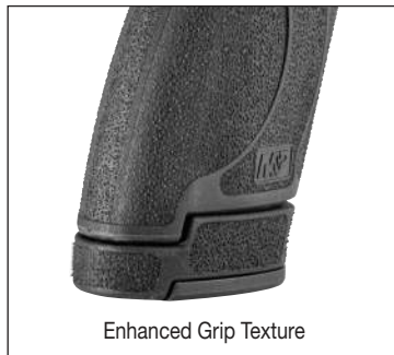
Enhanced Grip Texture