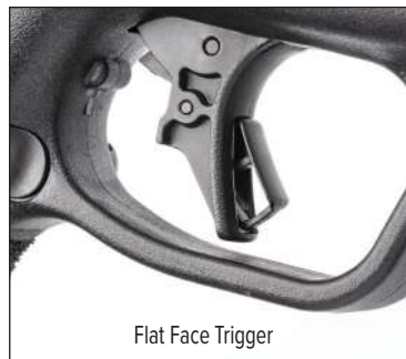
Flat Face Trigger

Armornite® finish is a hardened nitride finish that provides enhanced corrosion resistance, greatly improved wear resistance, decreased surface roughness, reduced light reflection and increased surface lubricity. Armornite® is used on many S&W® and M&P® products imparting a high level of protection internally and externally where applied.