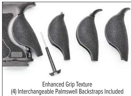
Enhanced Grip Texture (4) Interchangeable Palmwell Backstraps Included