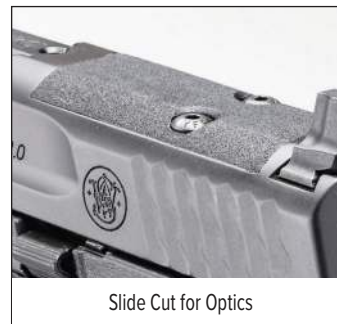
Slide Cut for Optics